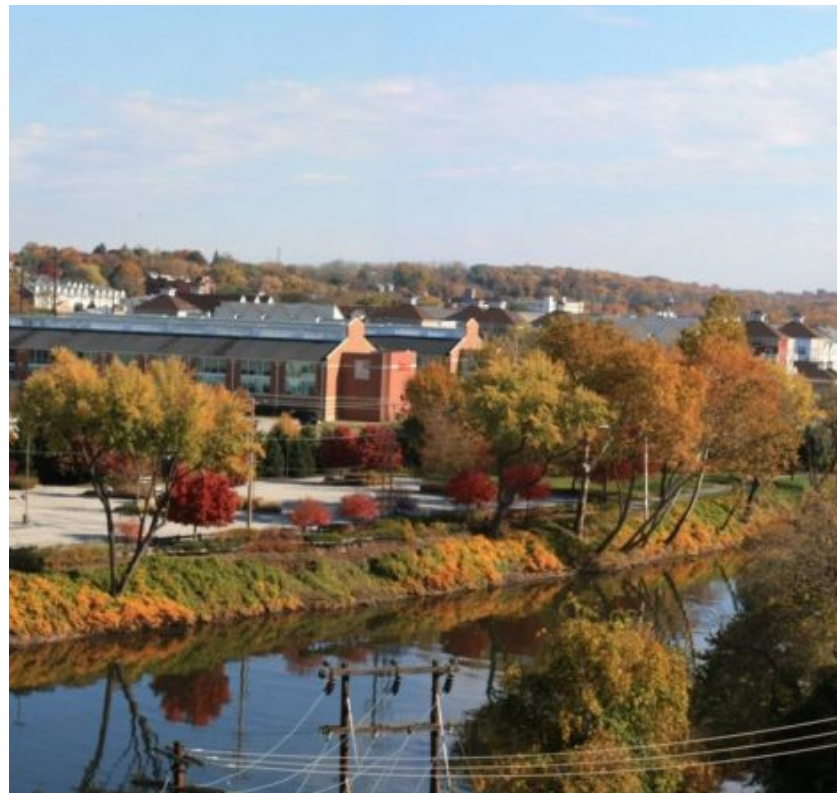
Schuylkill River in Conshohocken.

Projects to fulfill these improvements and State and Federal requirements will require substantial funding. Establishing a stormwater fee will generate the necessary funds for addressing infrastructure improvements, fulfilling permit requirements, conducting maintenance and repairs, and ultimately safeguarding public health and safety. The fee structure based on impervious area ensures that those who contribute more stormwater runoff to the system bear a proportionate share of the costs, promoting fairness and equity in funding the stormwater management program. The implementation of the stormwater fee will enable the Authority to undertake a wider range of stormwater projects throughout the Borough.