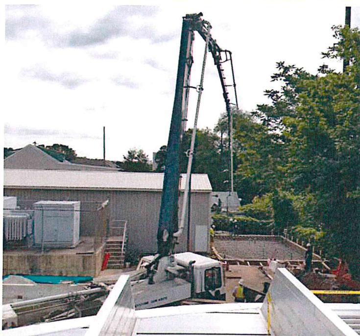
The Borough of Conshohocken Authority will soon conclude a $2.3 million project in an effort to control odors.

The project was expected to conclude on June 15. The Authority board, following a recommendation from its engineer and a thorough review of its findings, opted to extend the contract to July 15. The minor extension was needed after the contractor determined that soils at the equipment pad